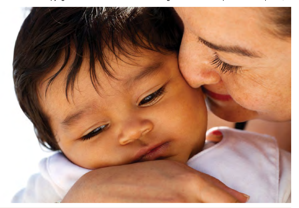
The trauma history of an identified group may be expressed through parent–child relationships in a variety of ways that impact young, developing children.