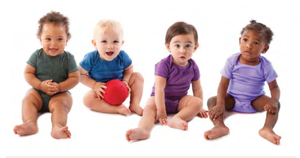
The emotional experience of the unconscious social hierarchy of skin color variation may have a significant psychological impact on parent-child relationships.

The practice of slavery has existed for most of recorded history. Although much is known about U.S. slavery from a historical,