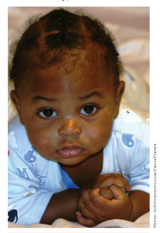
Inherent in messages communicated to children about racial features is an emotional message of acceptance or rejection.

Circumstances that were not subject to my control, but rather fixed phenotypes that were a part of my genetic make-up, caused me to be the target of extreme ridicule and rejection. Although the color of my skin was not the focus of the teasing, I made an association between the amount of pigmentation in my skin and the texture of my hair and, thus desired to have lighter skin. Characteristics that I should have been proud of that make me