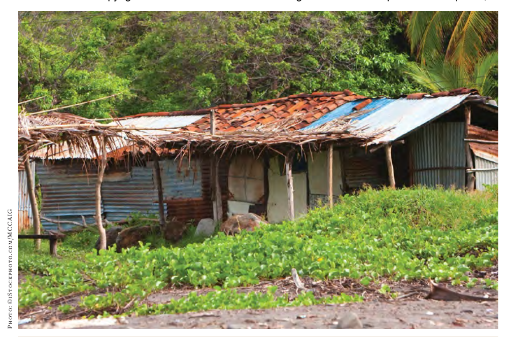
El \, Salvador's \, history \, reflects \, the \, oppression \, of \, communities \, of \, color \, in \, the \, rest \, of \, Latin \, America.