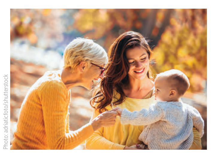
None of us can parent alone, none of us are able to succeed on our own.