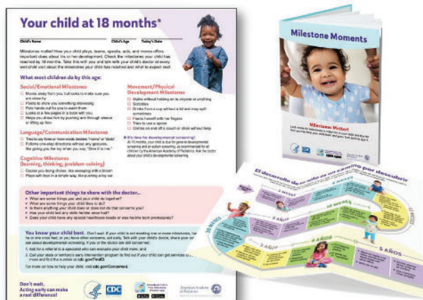
Figure 1. Sample “Learn the Signs. Act Early.” Print Resources

There was also confusion about what milestones were most important on the checklists and when a missed milestone should prompt conversation between families and professionals. The previous checklists had two lists of milestones: a general list of milestones and an “Act early...Don't wait” call-out box encouraging further action. This format created confusion on whether missing milestones in the general list and/or the “act early” list were concerning, and professionals