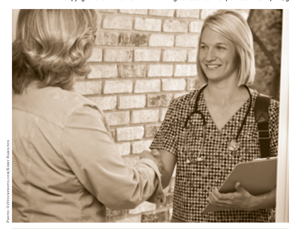
Home visitors bring a range of experiences and credentials to their work.

management information systems into a tool that can be used by state administrators and policymakers to better assess the combined coverage and level of effort achieved across all of the models being implemented. These types of integration efforts may become more common as additional states move toward creating a network of services that can address the diverse needs of their entire new parent population.