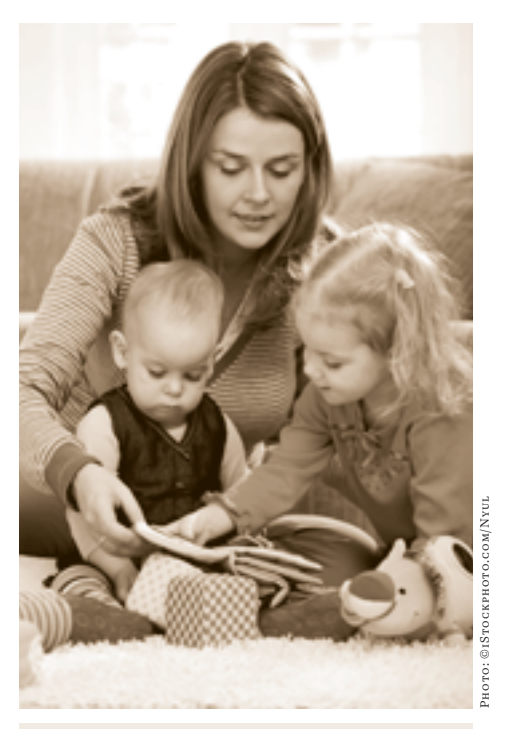
Home visiting aims to provide a range of supports for families.

Over roughly the same period of time individual evaluations and meta-analyses of existing evaluations have provided mixed results about the effectiveness of providing home visiting services to pregnant mothers and young children. Research on the impacts of home visiting for parents is mixed, with some home visiting program models demonstrating impacts on birth outcomes, parent health, children's language