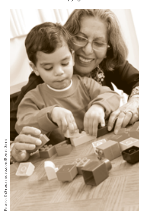
Research on the impacts of home visiting for parents is mixed.

program models. Agencies and stakeholders interested in offering home visiting services invest in approaches that seem most likely to achieve their targeted outcomes and fit within state or local contexts and agency cultures as well as within the limits of available resources and capacities. The result is a complex web of home visiting services sometimes multiple models operating under different auspices in a community or state, other times a single model operating in one or multiple locations and settings.